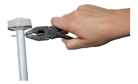
Step 1 Unscrew the top piece.